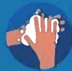
SCRUB: 20 SECONDS